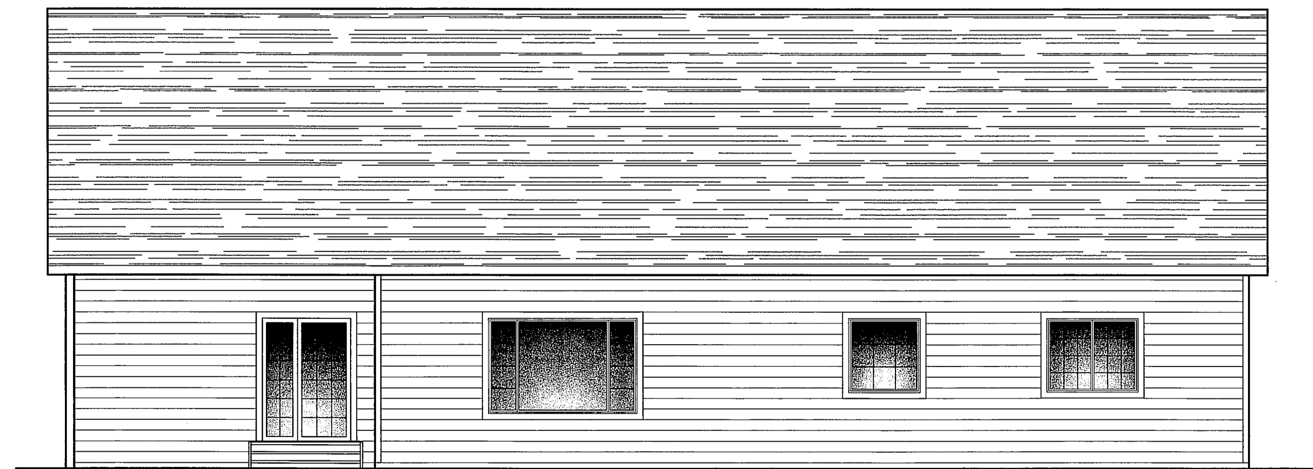
SOUTH ELEVATION SCALE: 3/16" = 1'-0"