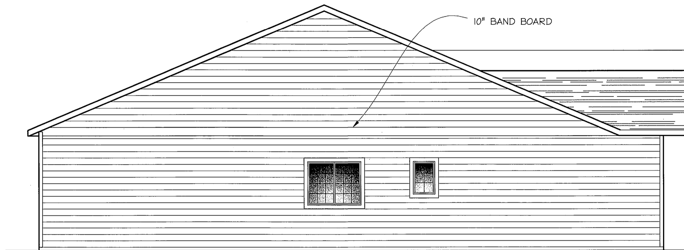
EAST ELEVATION SCALE: 3/16" = 1'-0"