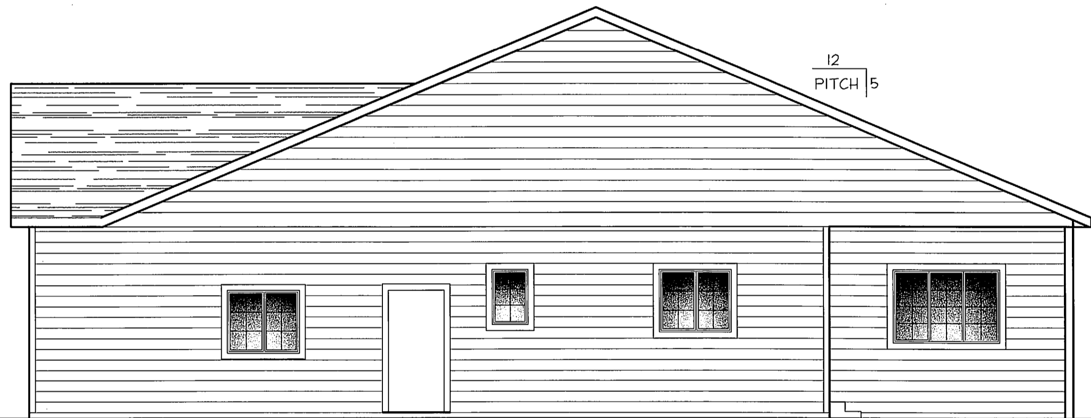
WEST ELEVATION SCALE: 3/16" = 1'-0"