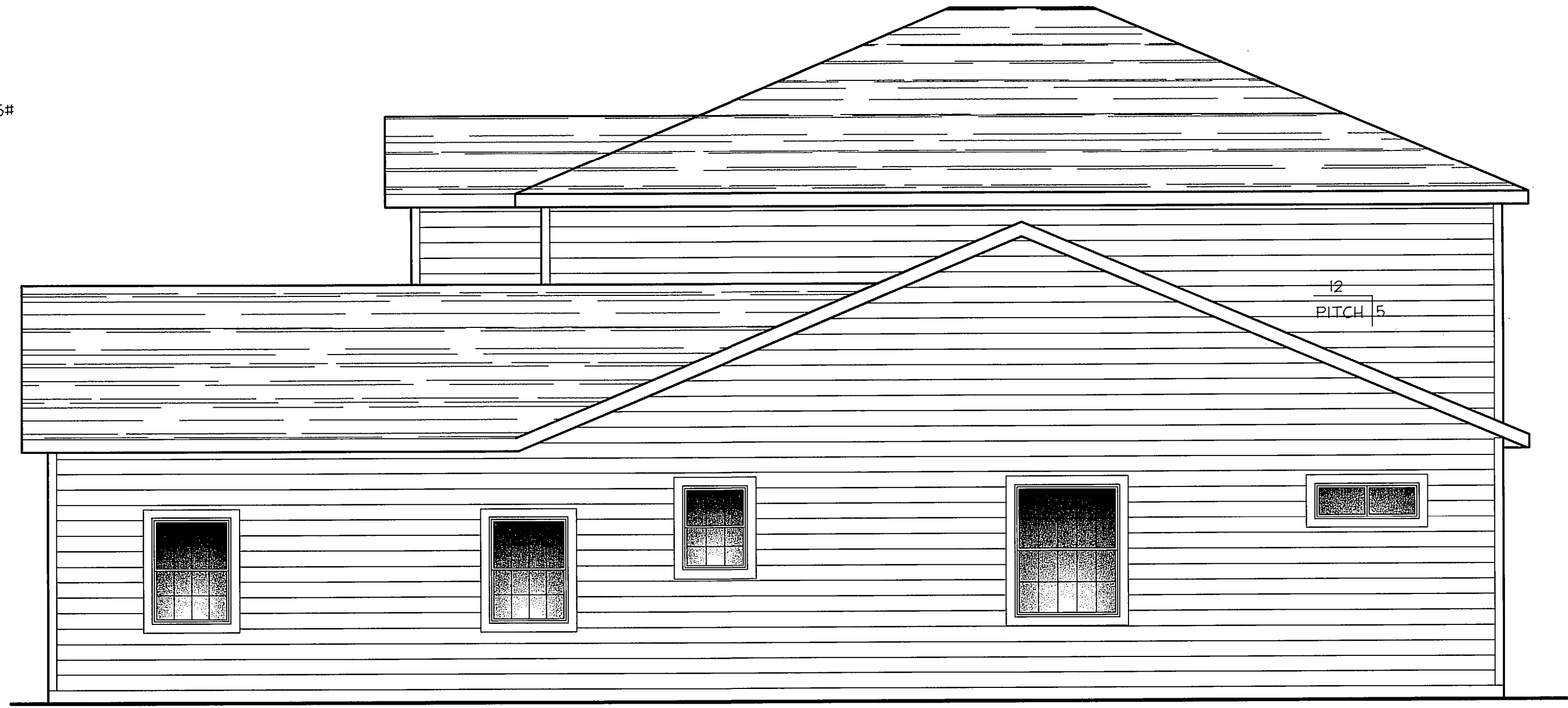
WEST ELEVATION SCALE: 1/4" = 1'-0"