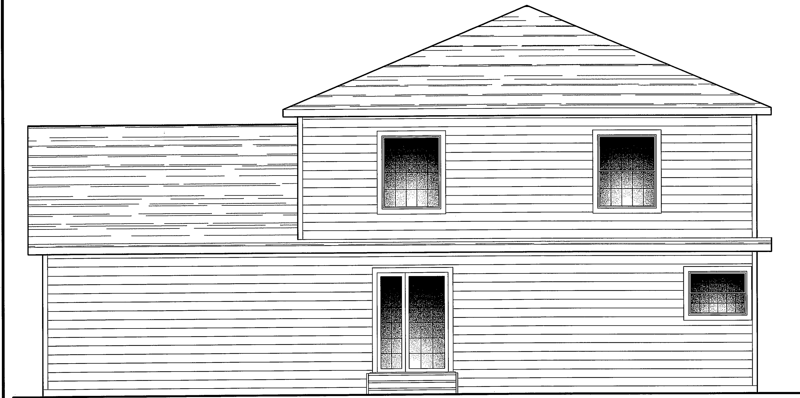
SOUTH ELEVATION SCALE: 1/4" = 1'-0"