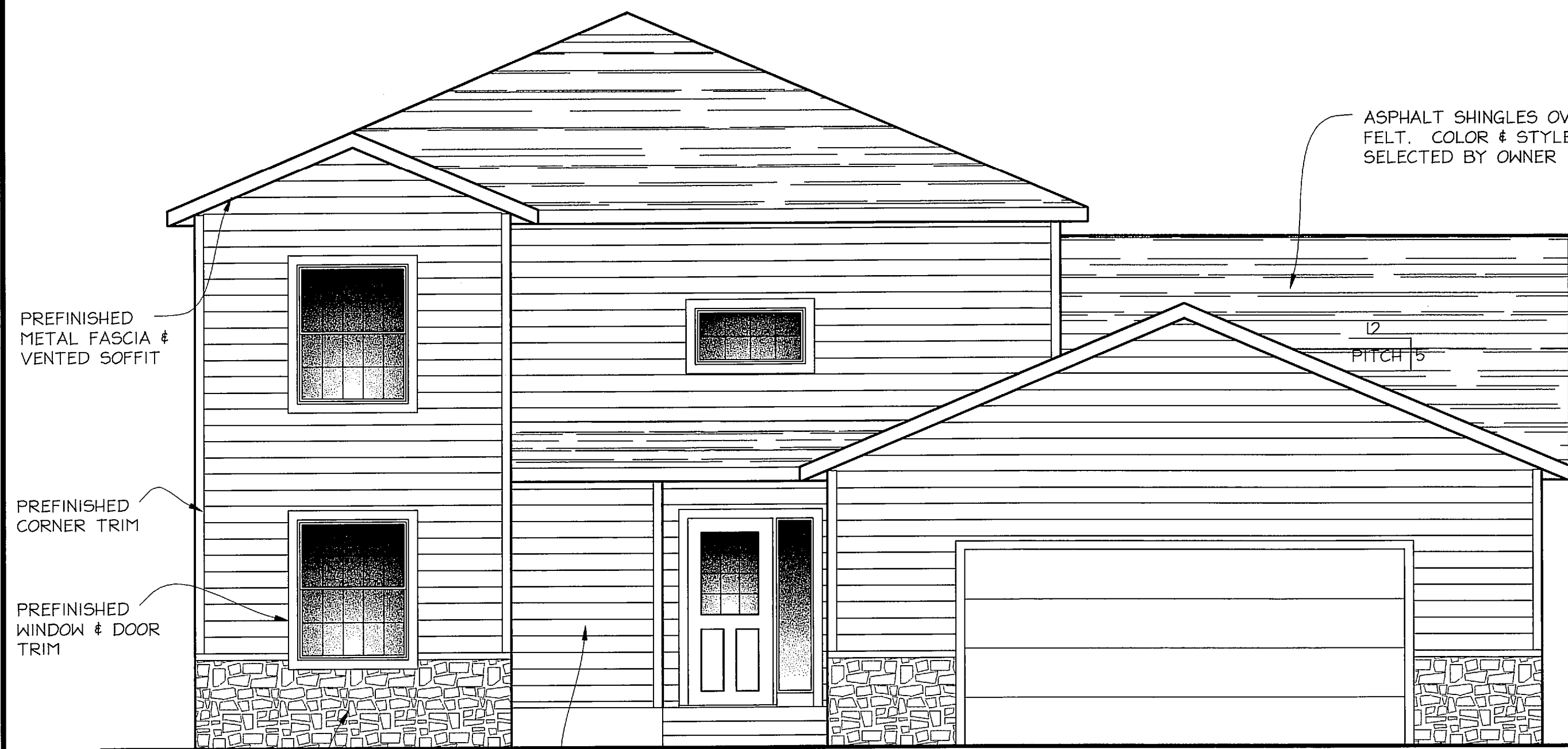
NORTH ELEVATION SCALE: 1/4" = 1'-0"